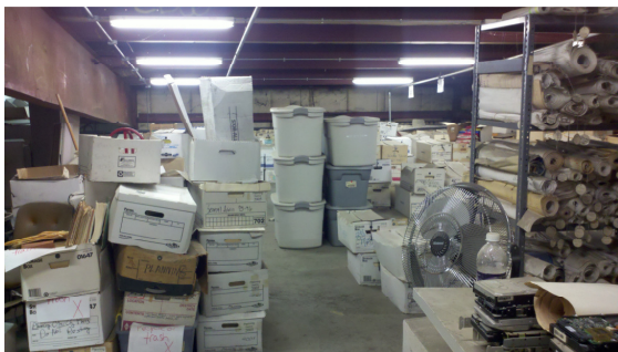
Before: SWAN mezzanine, facing south