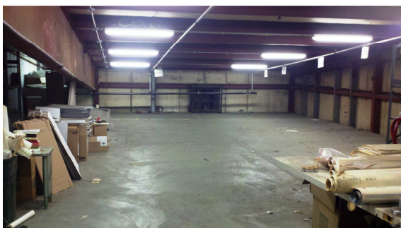
After: SWAN mezzanine, facing south