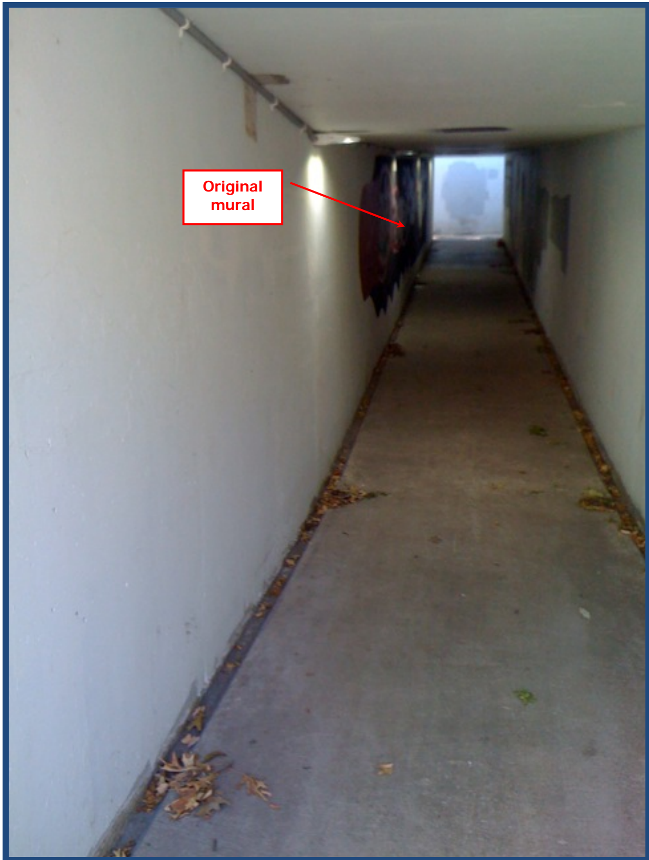
After cleanup, new paint and new lighting 2011