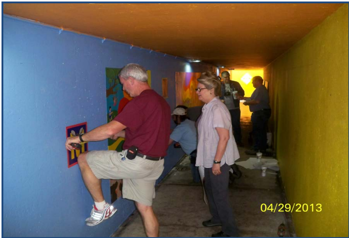
Installation of murals