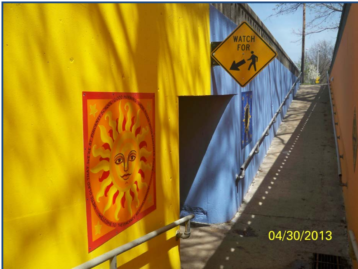
South tunnel access complete