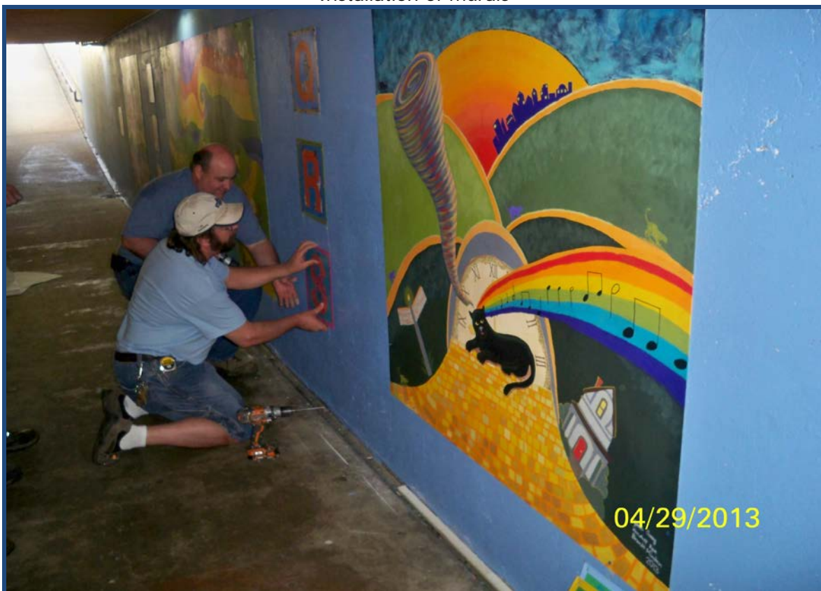
Installation of murals