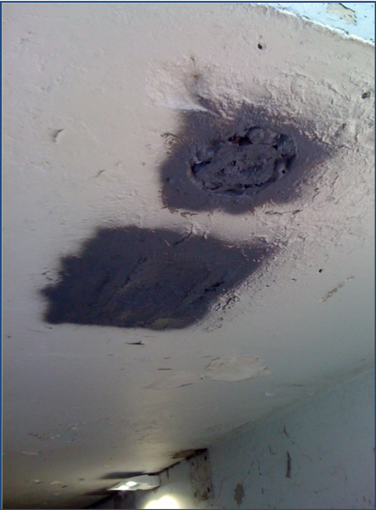
Deteriorated ceiling and peeling paint