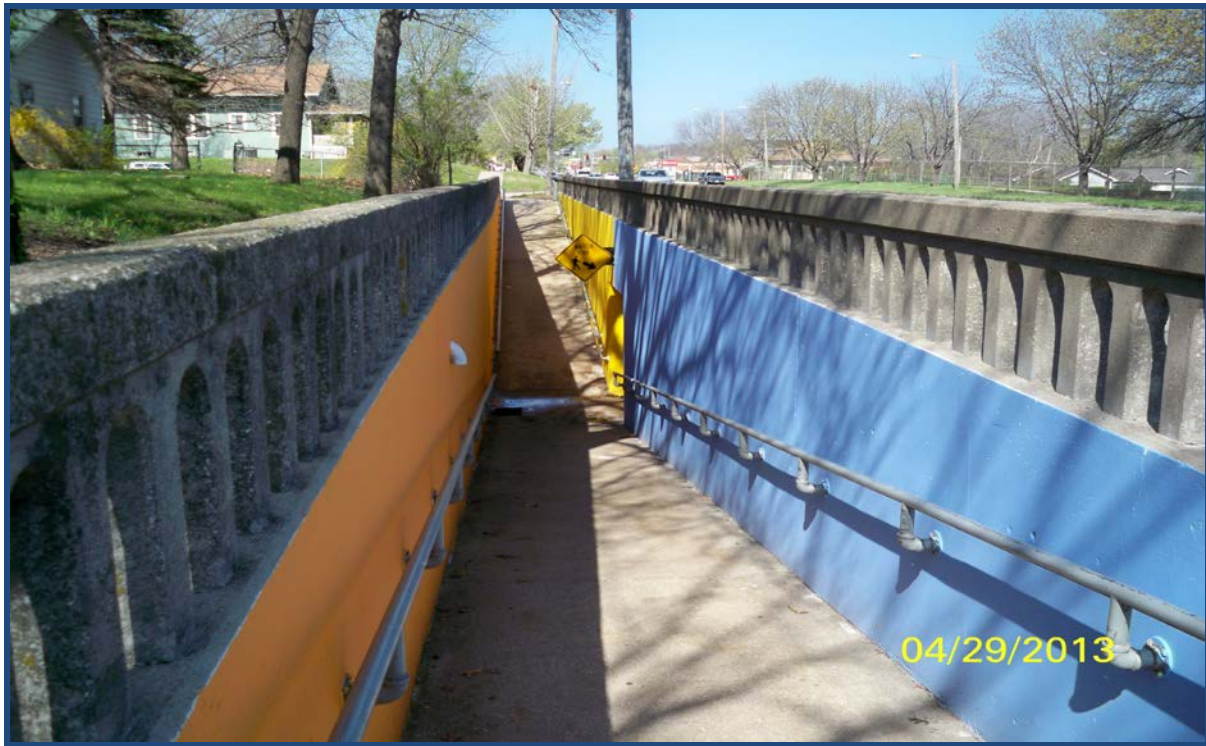
Completed south access ramps