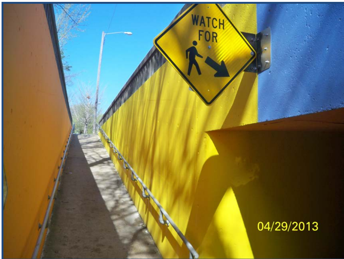
Tunnel south access point with warning sign