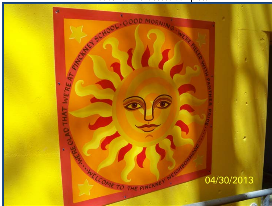
Starting point for mural theme