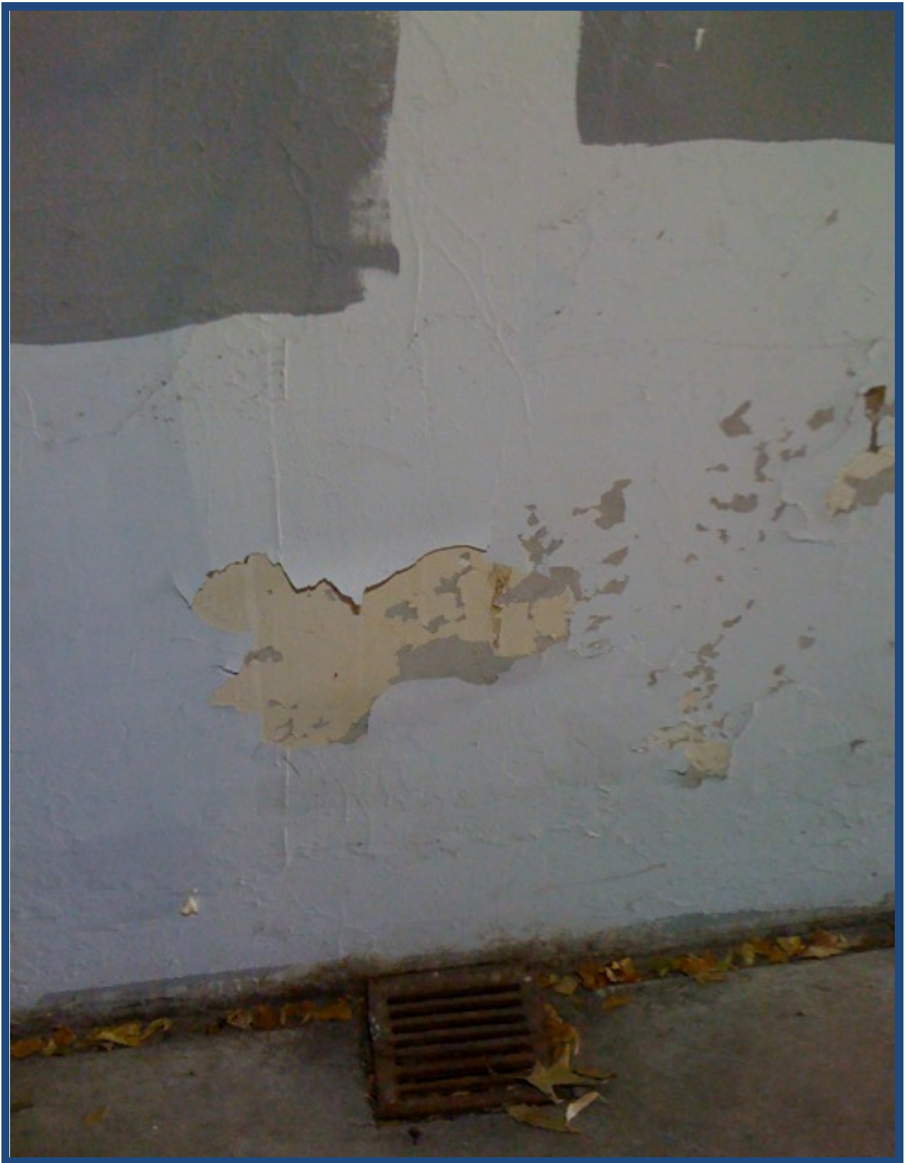
Peeling paint and clogged drains