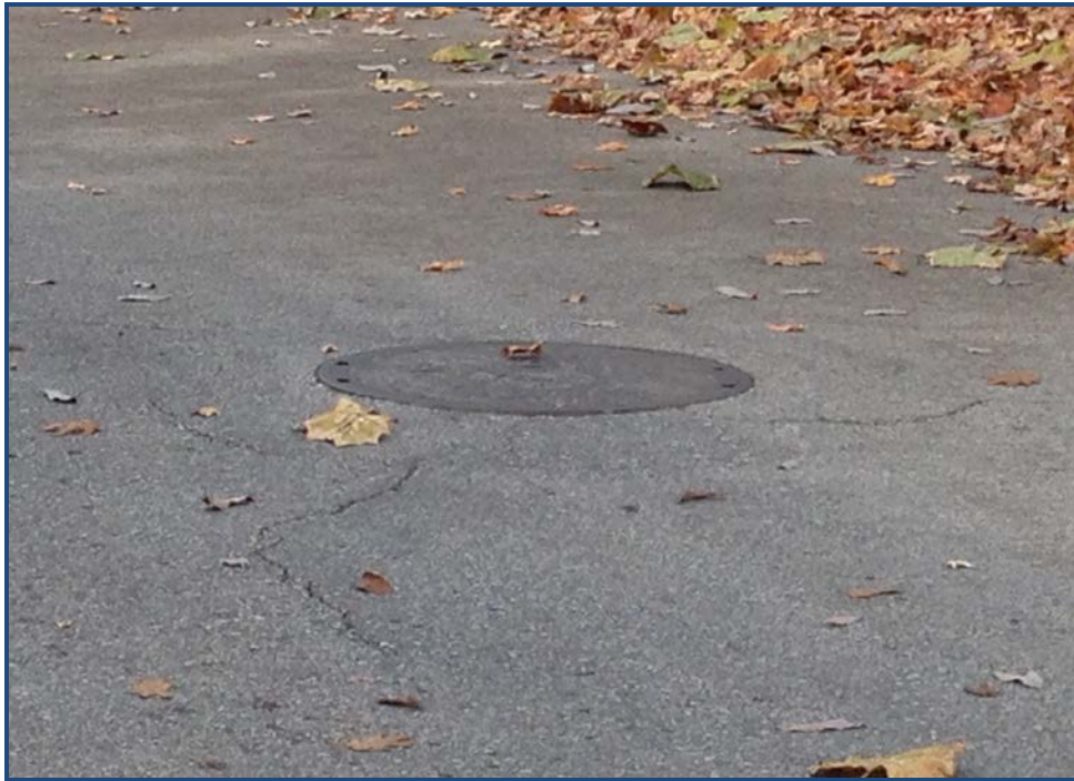
Typical Man-Hole Installation