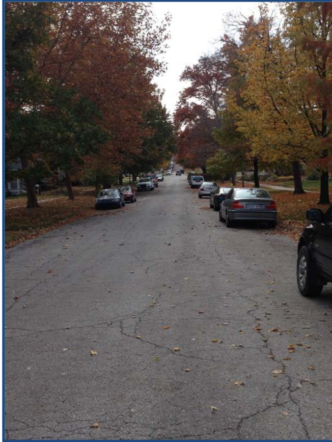
800 Block of Ohio Street