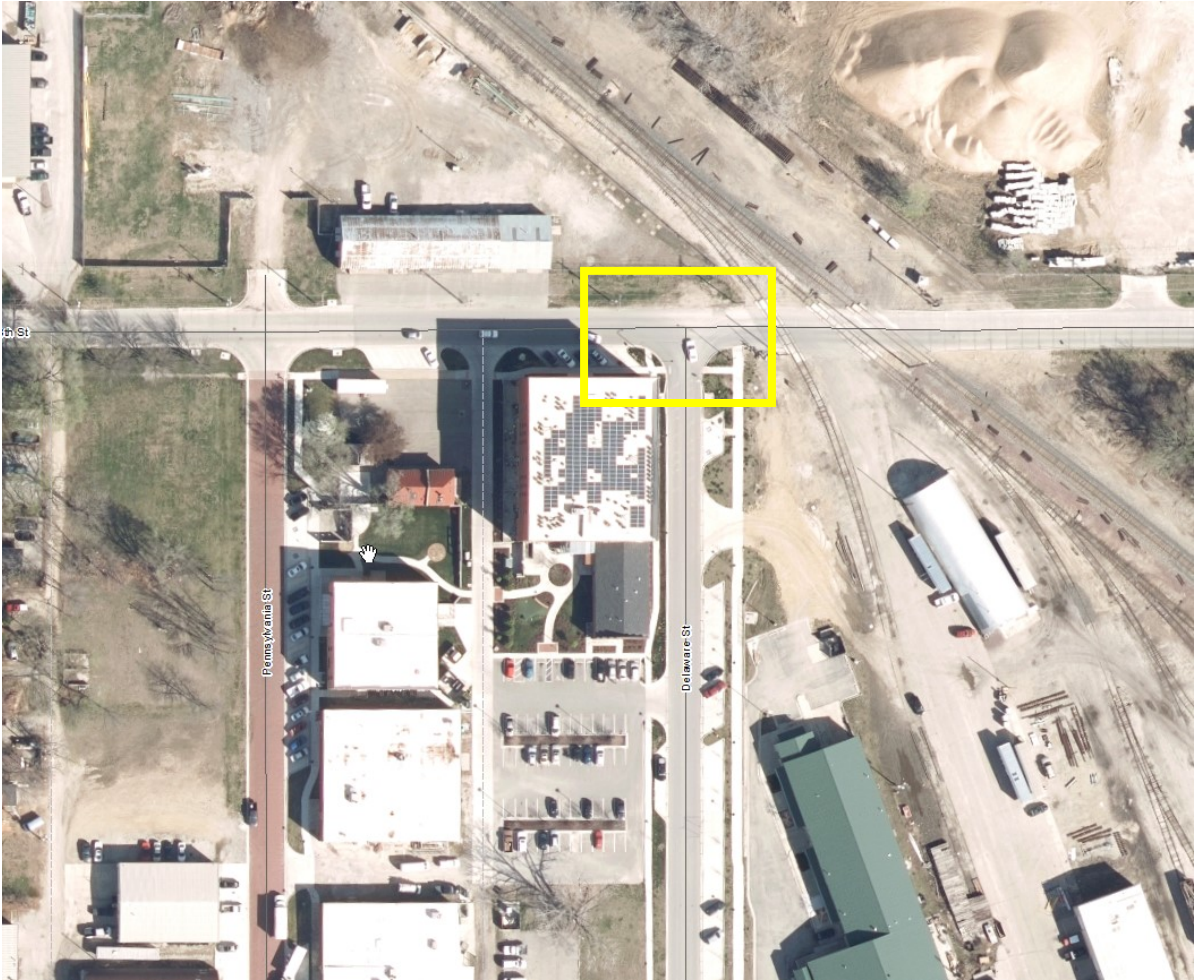
Stop Signs – 8 th Street at Delaware Street