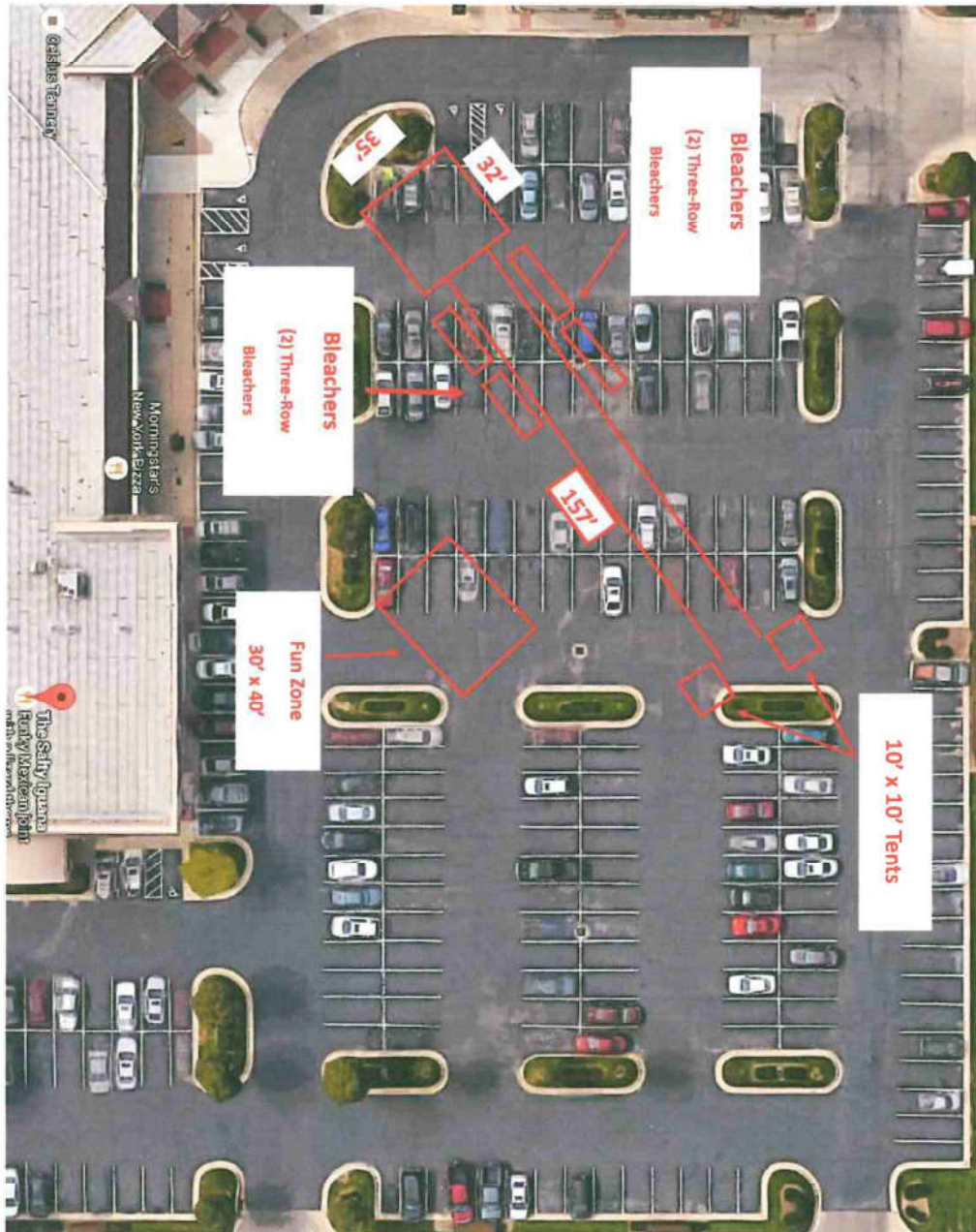
Plan B – Based on Wind Direction