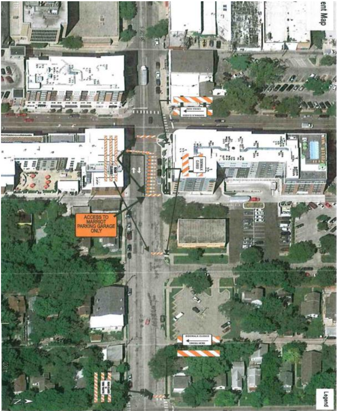
Image 3: Proposed spectator area. The applicant proposes a portion of E. 9 th Street be closed off to vehicle traffic during the Over the Edge event. Traffic management and sidewalk closure signs will be placed in the surrounding area.