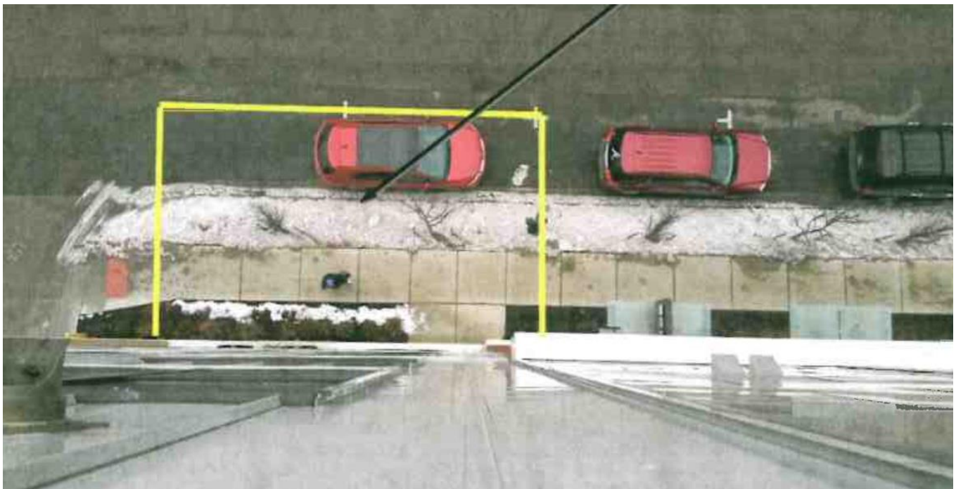
Image 2: An aerial view of the rappelling landing zone. Participants will rappel down the southern side of 888 New Hampshire and land along E. 9 th Street.