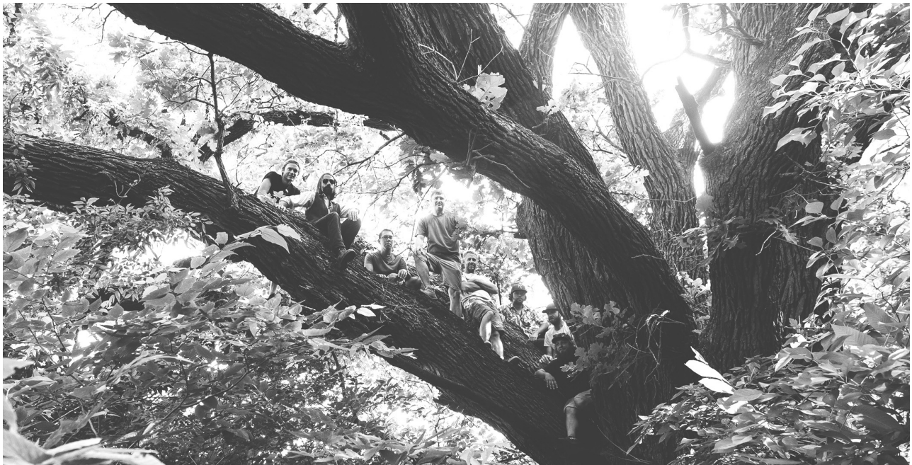
This issue is sponsored by a generous donation from:

PRSR STD U.S. POSTAGE PAID LAWRENCE, KS PERMIT #542